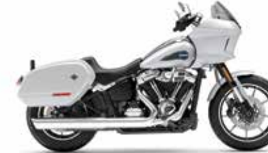
LOW RIDER™ ST