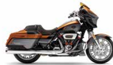
CVO™ STREET GLIDE™