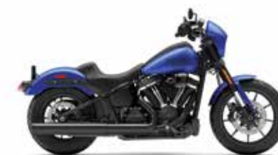
LOW RIDER™ S